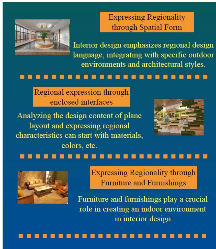
Fig.2 Interior Space Image Design

① to express regionality through spatial forms.